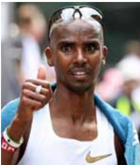
Mo Farah is the fastest ever European in the marathon.

The Beagle, a six-time world champion and double Olympic champion at both 10,000m and